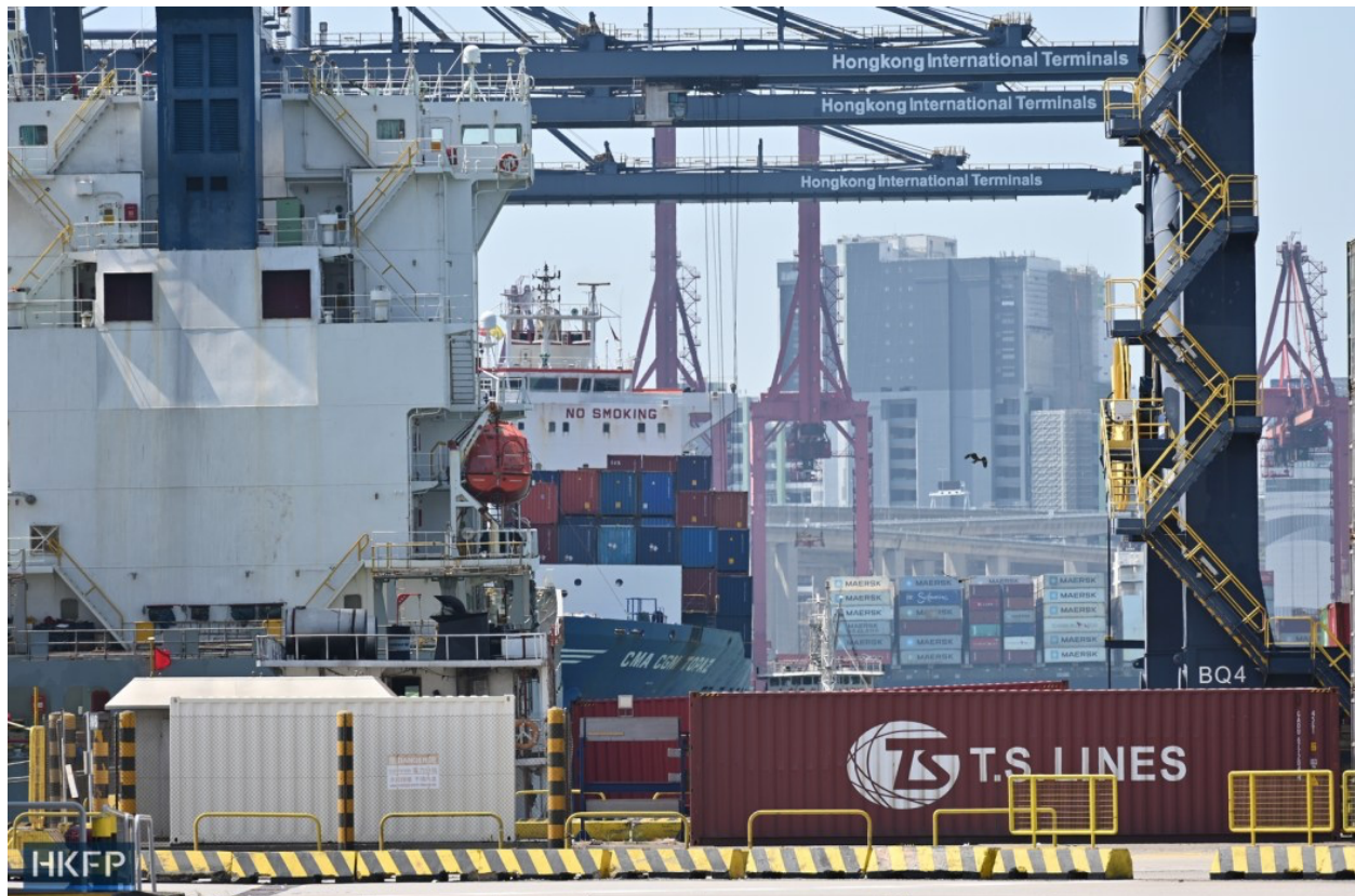
A section of the Kwai Tsing Container Terminals that was managed by Hongkong International Terminals.

"The person was confirmed dead at the scene," police said in a statement. "After a preliminary investigation by the officers, it is believed that the person was accidentally run over by a gantry crane."