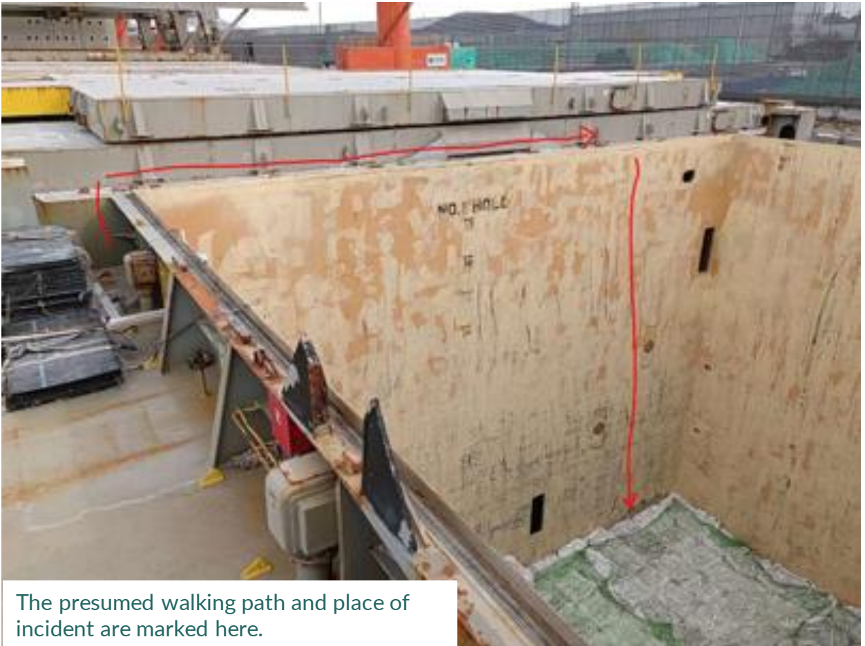
The presumed walking path and place of incident are marked here.