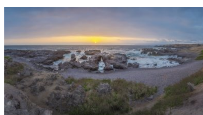
They will carry out a citizen consultation for the conservation of the La Chimba wetland 8 hours ago