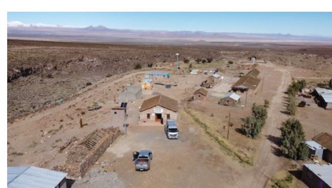
Primary Health Care expands the services and benefits in medical rounds of the towns of Alto el Loa 7 hours ago