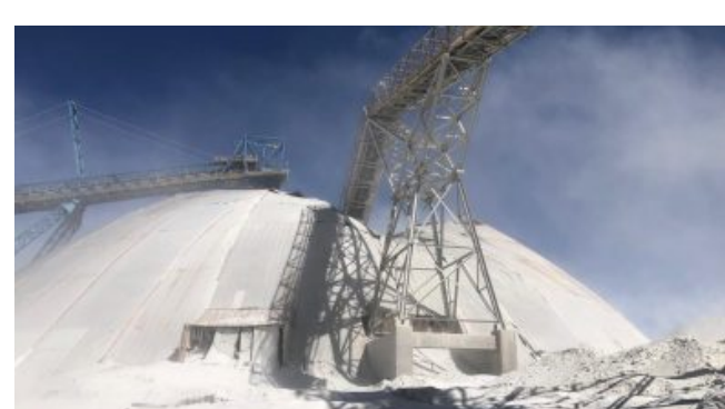
Serious conveyor belt incident in Chuquicamata 45 mins ago