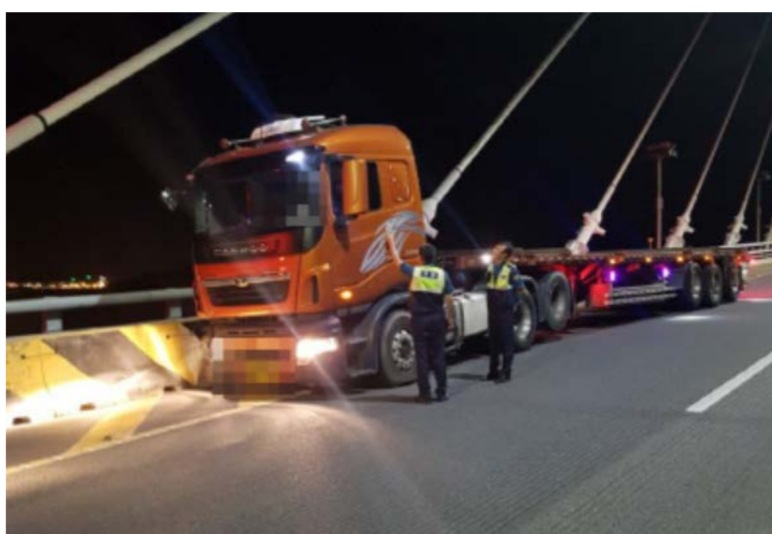
▲ A port worker in his 40s was hit and killed by a trailer transporting containers at Incheon Port. Images are not directly related to the article.

A port worker in his 40s was hit by a trailer carrying containers and died.