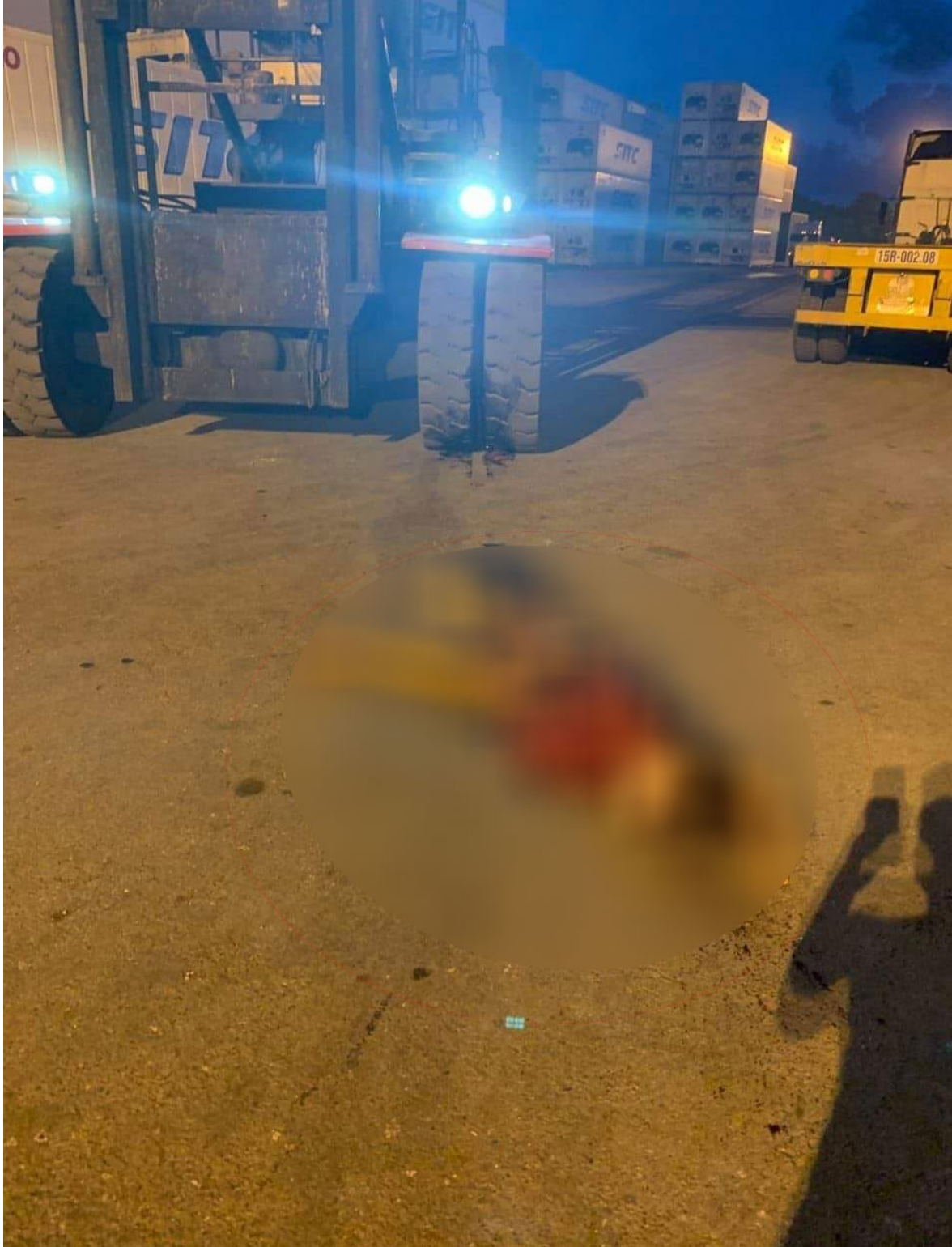
The identity of the victim who was killed by a forklift truck is currently unknown

Upon receiving the news, the functional forces were quickly present to regulate traffic, examine the scene and investigate and clarify the cause of the accident.