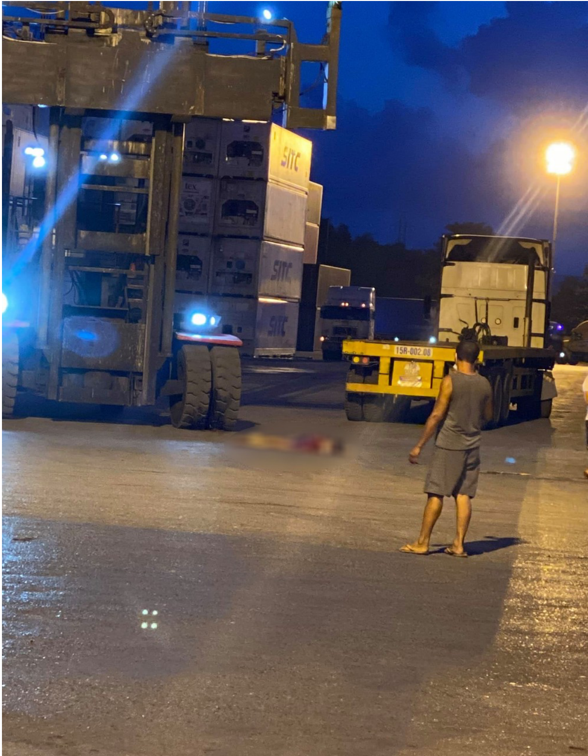
The scene of a serious accident in Dinh Vu port

It appears that the forklift driver did not observe the man sitting. The accident caused the victim to die on the spot.