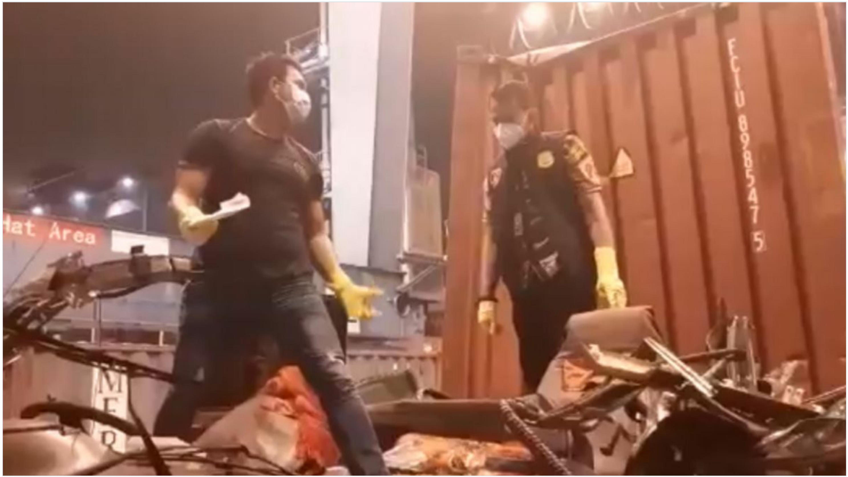
Screenshot of the video when the Tanjung Priok Port Police Criminal Investigation Unit inspects a truck that had an accident